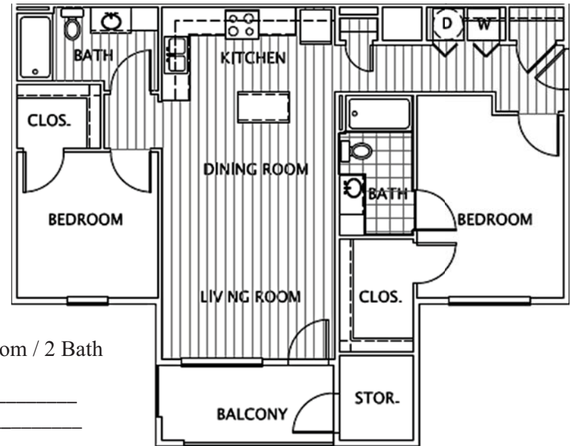
2 Bedroom / 2 Bath Rent _____ Deposit _____