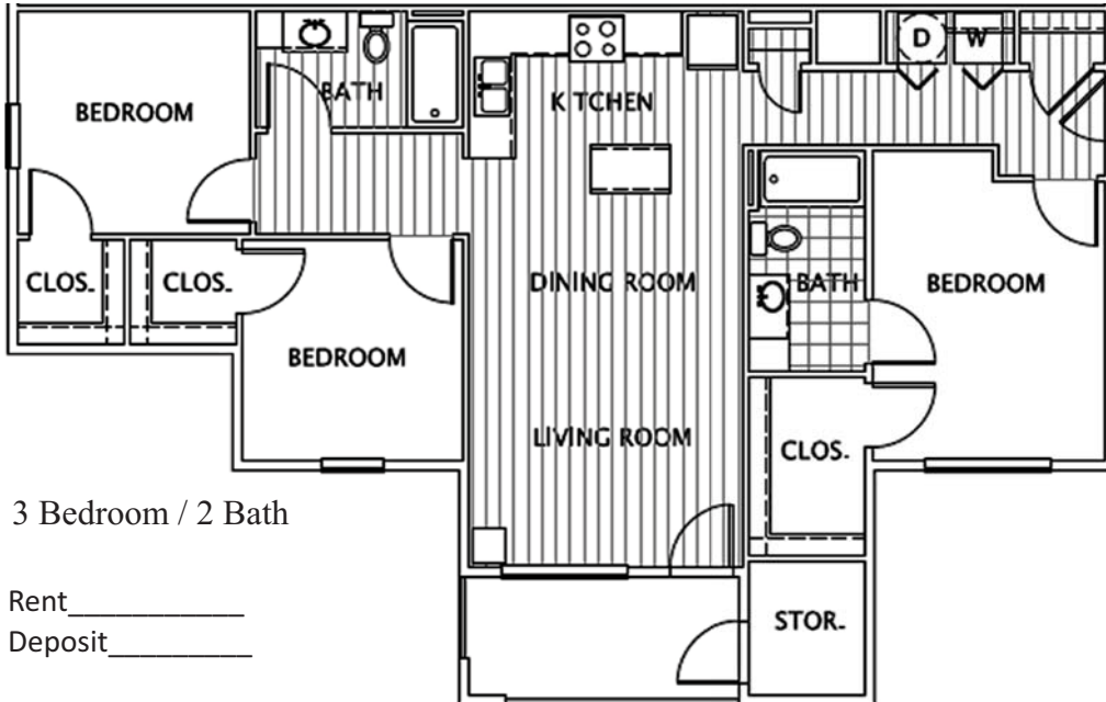
3 Bedroom / 2 Bath Rent _____ Deposit _____